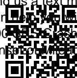
Image Correction, BHP Decoding, Performance Remap, PDFFAPEGR OFF, ECU Re-mapping, Immo Off https://www.freeadsz.co.uk/x-1623 21-z

https://www.freedasz.co.uk/x-1623 ECU Re-mapping, Immo Off Remap, PDFFAPEGR OFF Decoding, Performance BHP Mileage Correction, Radio 21-z