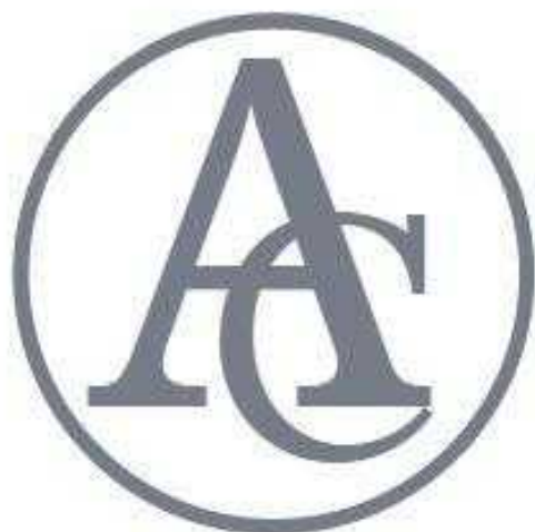
Ahmed & Co Business Services Ltd