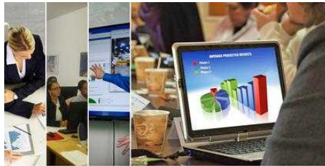
VITAL BUSINESS CONSULTING LTD consultancy for small to medium size businesses

We provide management consultancy to small to medium size businesses. Our experienced team can help you improve the outlook of your business. Our professional approach and objective advice will help your business in creating value, maximising shareholders wealth and improving business performances.