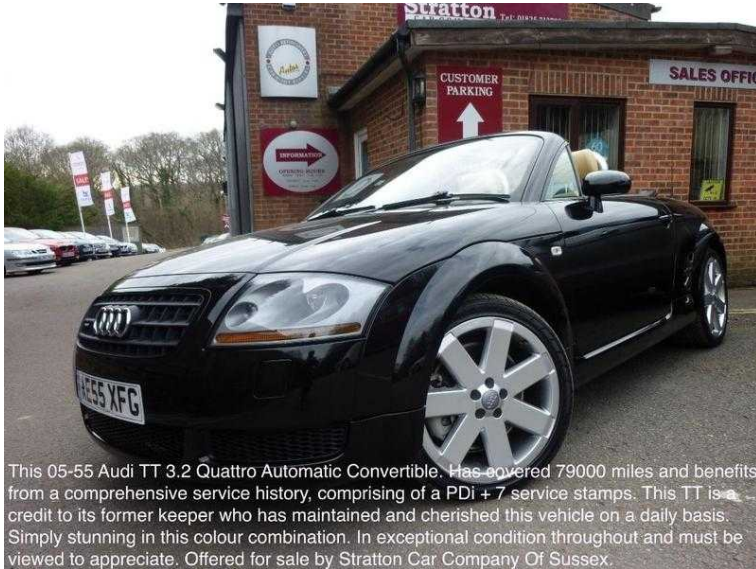
This 05-55 Audi TT 3.2 Quattro Automatic Convertible. Has covered 79000 miles and benefits from a comprehensive service history, comprising of a PDI + 7 service stamps. This TT is a credit to its former keeper who has maintained and cherished this vehicle on a daily basis. Simply stunning in this colour combination. In exceptional condition throughout and must be viewed to appreciate. Offered for sale by Stratton Car Company Of Sussex.