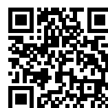
Table2 chairs, outdoor, Trn https://www.freeadsz.co.uk/x-333128-z