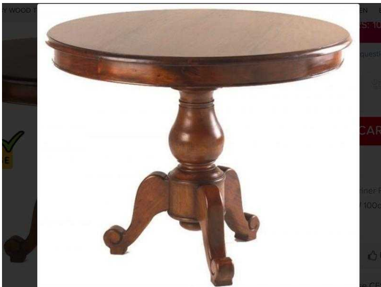
Table. Circular Mariners Table (55 GBP)

Location South West, Isle Of Wight https://www.freeadsz.co.uk/x-461184-z