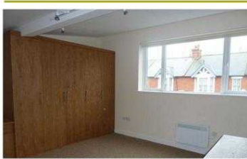
5a New Broadway Tarring Road, Worthing, West Sussex, BN11 4HP

An opportunity to rent this recently converted and newly fitted studio apartment conveniently located close to West Worthing Station and local shops and facilities. The property benefits from having a brand new fitted kitchen and fitted shower-room, as well as fitted bedroom furniture and a foldaway double bed. The property has its own private entrance, new carpets and electric heating.