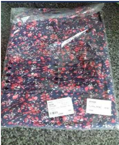
Lisa McKeenan Brand new with tags and just took out wrapper to take picture size 8 10 from South paid £26 floral print cold shoulder dip top collect only havant £10

Location South West, Isle Of Wight https://www.freeadsz.co.uk/x-533830-z