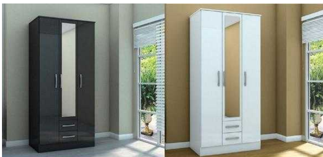
LYNX 3 DOOR 2 DRAWER WARDROBE