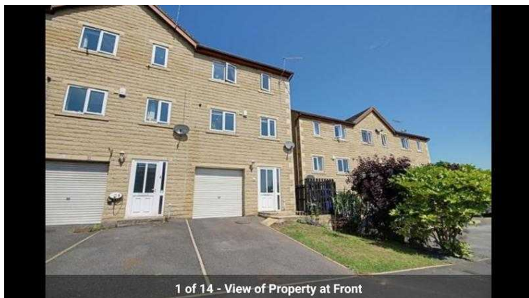
1 of 14 - View of Property at Front

Views across the Don Valley Bowl and backing on to protected heritage land perfect for a first time buyer or young family due to local schools. Fantastic transport links (train and tram only 5 min walk away) and commuter access (M1 junction 24).