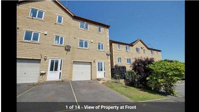
1 of 14 - View of Property at Front

Views across the Don Valley Bowl and backing on to protected heritage land perfect for a first time buyer or young family due to local schools. Fantastic transport links (train and tram only 5 min walk away) and commuter access (M1 junction 24).