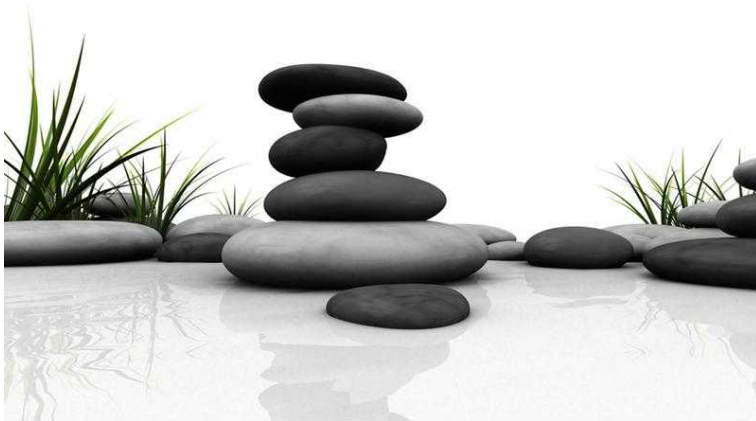
Fig Leaf Massage